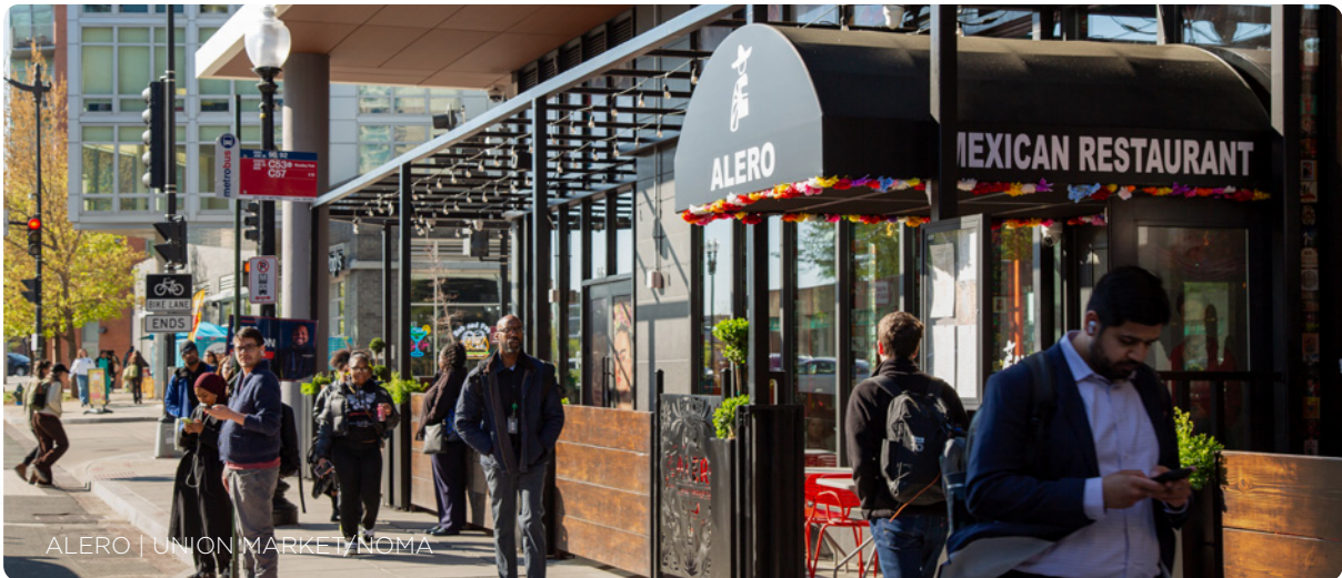
ALERO | UNION MARKET / NOMA