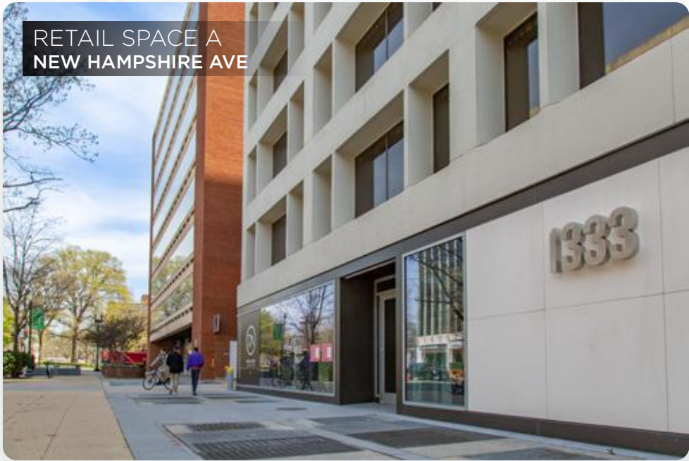
RETAIL SPACE A NEW HAMPSHIRE AVE