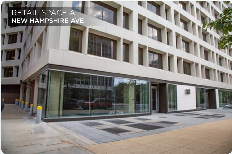
RETAIL SPACE A NEW HAMPSHIRE AVE