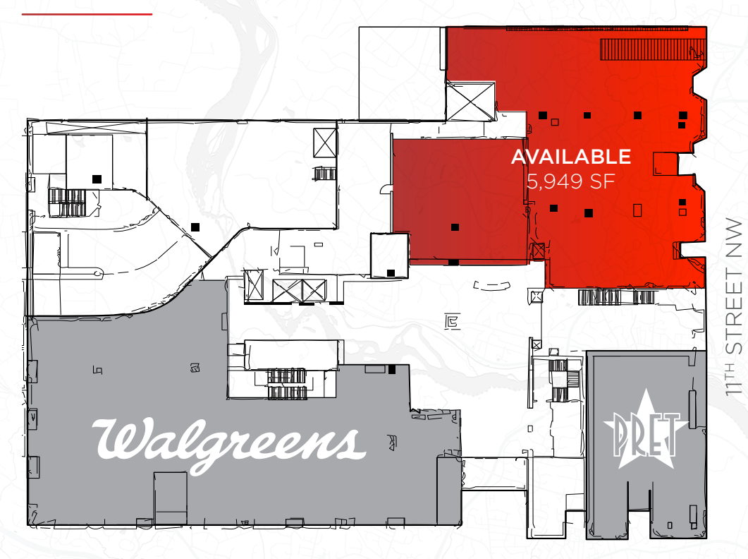
F STREET NW