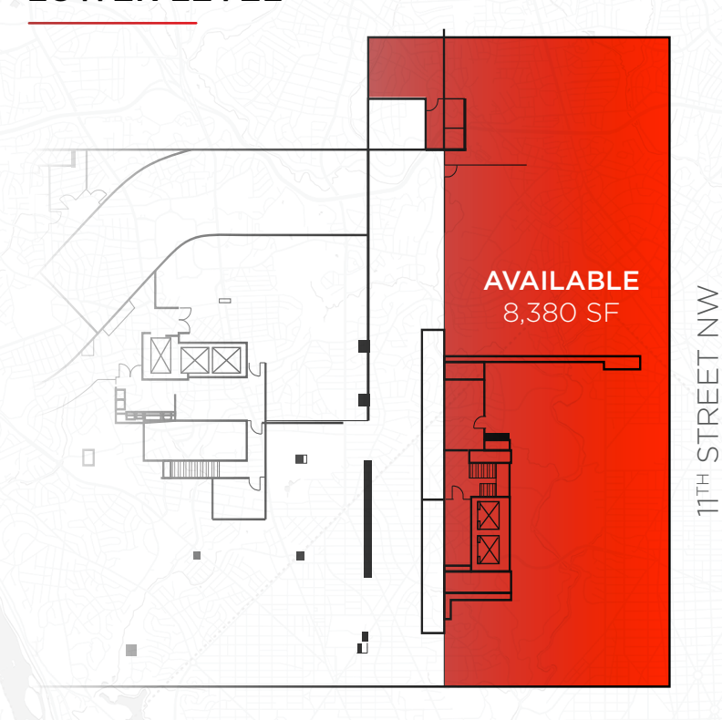
F STREET NW